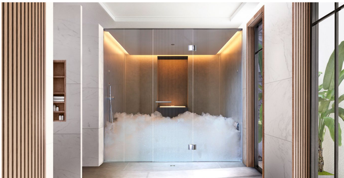
World's first foam steam bath ESPURO®

As with all KLAFS products for hotels, spas and public facilities, attributes such as a smooth bathing process, the lowest possible energy consumption and minimal cleaning effort are of primary importance to KLAFS. In the case of the new ESPURO® foam steam bath, the latter was worked out together with the recognized hygiene laboratory WHU GmbH (Water, Hygiene, Environment) and Dipl. Ing. Dr. Arno Sorger. The hygiene concept, which has been verified by an expert opinion, guarantees optimum and efficient cleaning after each bathing session. Within the shortest possible time, the foam is degassed by special nozzles and does not reach the area in front of the steam bath. All water-bearing pipes are rinsed and disinfected at the touch of a button. Thanks to this sophisticated cleaning and hygiene concept, not only does every guest feel safe and completely at ease, but the experience in the foam is also completely worry-free for the operators of the facility.